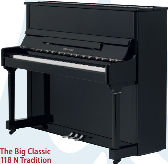
The Big Classic 118 N Tradition

Our diminutive piano in a traditional look and solid construction with a good sound. Its affordable price has made it a sought after piano not only for beginners. Provided with Lid safty top.