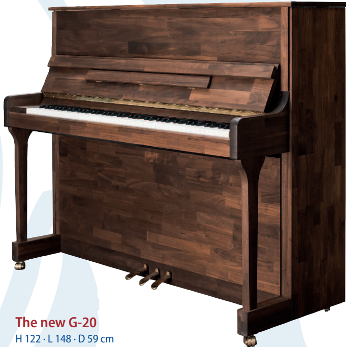
The new G-20