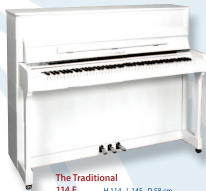
The Traditional 114 E

Our grand pianos are constructed with the best all-natural materials such as wood, felt of virgin wool and leather. The sturdy cast frame and the massive sub-frame ensure a durable long life. The sound board, made of massive mountain spruce which grew uniformly, provides a radiant range of tones. All of our models feature a sostenuto pedal.