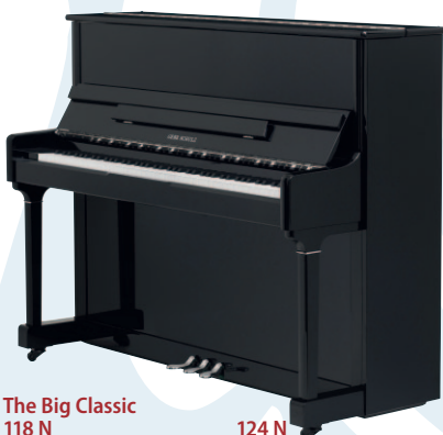
The Big Classic 118 N

Our diminutive piano in a traditional look and solid construction with a good sound. Its affordable price has made it a sought after piano not only for beginners. Provided with Lid safety top.