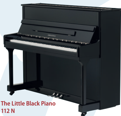
The Little Black Piano 112 N